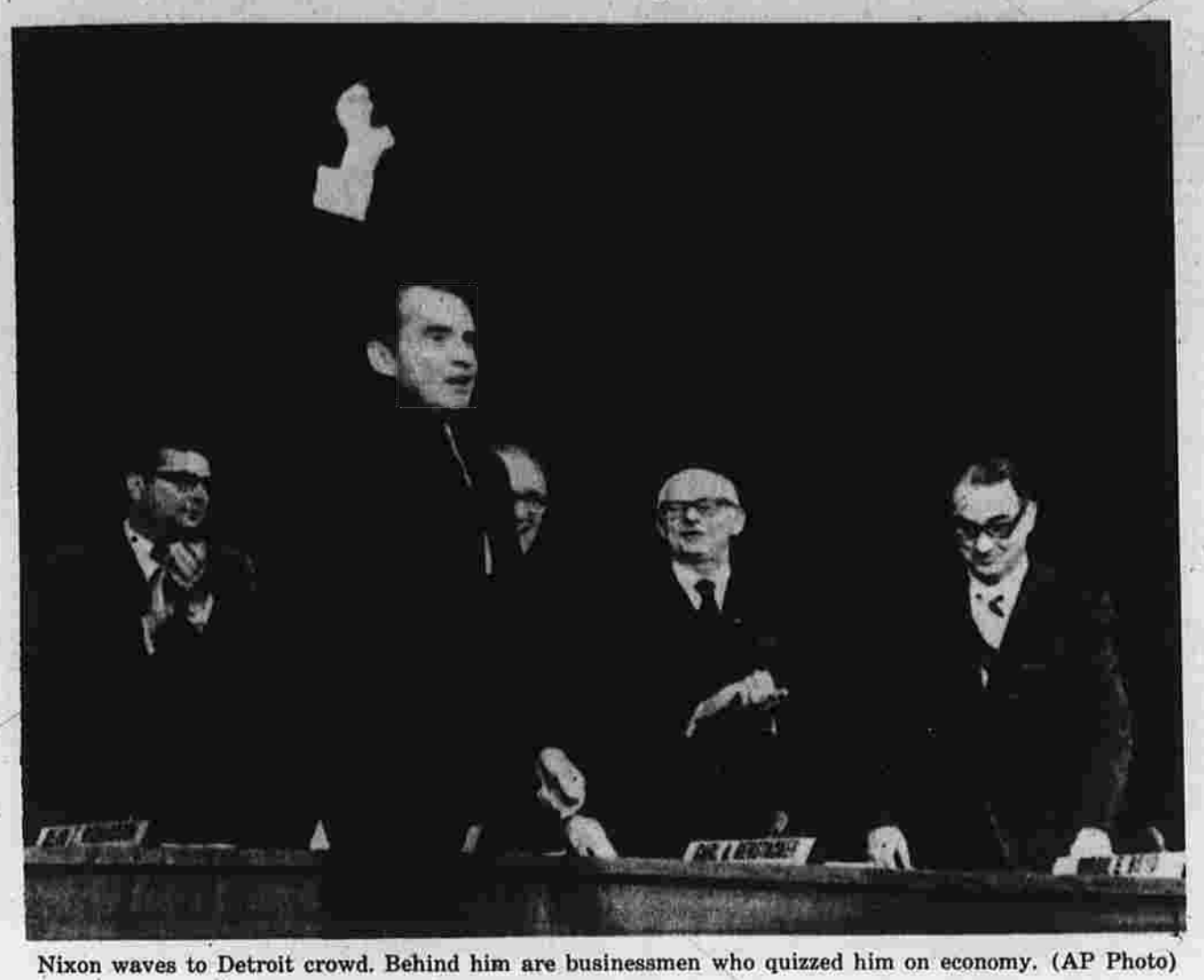
Nixon waves to Detroit crowd. Behind him are businessmen who quizzed him on economy.

DETROIT (AP)—A woman who police say wanted to capture a jetliner and use it to help two jailed Panthers flee the country was arrested with dynamite and a pistol today at Metropolitan Airport.